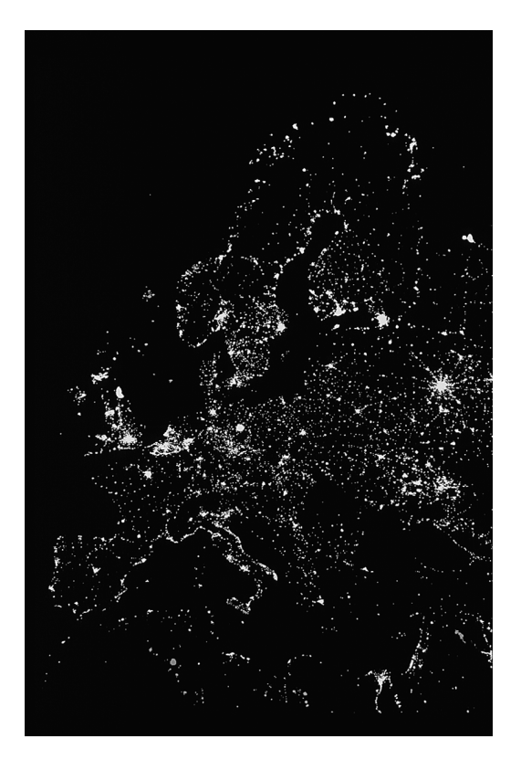
Figure 1. "Europe at Night," in which modern settlements appear as pin pricks of light.

This paper, which divides into six parts, reports preliminary research on the empirical groundwork required for describing the new metageography of relations between world cities. Such a modest goal is made necessary because of a critical empirical deficit within the world-city literature on intercity relations. In the first part, we show this to be a generic problem across all the different research schools within the literature. By concentrating on the attributes of world cities and neglecting their relations, we learn a lot about the nodes in the network, but relatively little about the network itself. In a brief second part, we introduce Castell's concept of network society, in which the world-city network does feature, and although this provides a conceptual framework for our research, the empirical problematic remains. Our particular solution to this data problem is to focus on the global office-location strategies of major corporateservice firms; in the third part, we outline this